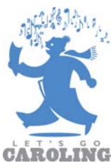
LET'S GO CAROLING

It's a New Year's Eve party and watch night service all rolled into one - Dec. 31 from 5:30 to 8:30 in the Busch Center. Bring a game and finger foods to share. If you are just coming for worship, come from 5:30 to 6 to give thanks for the year past and launch the new year in worship. Afterward we'll eat and play games.